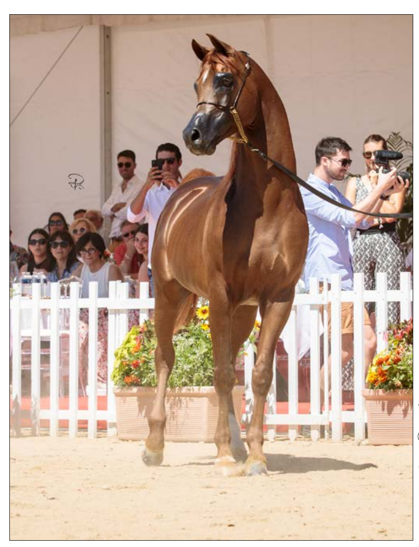
Frabian Stallions (5) of the World XVII