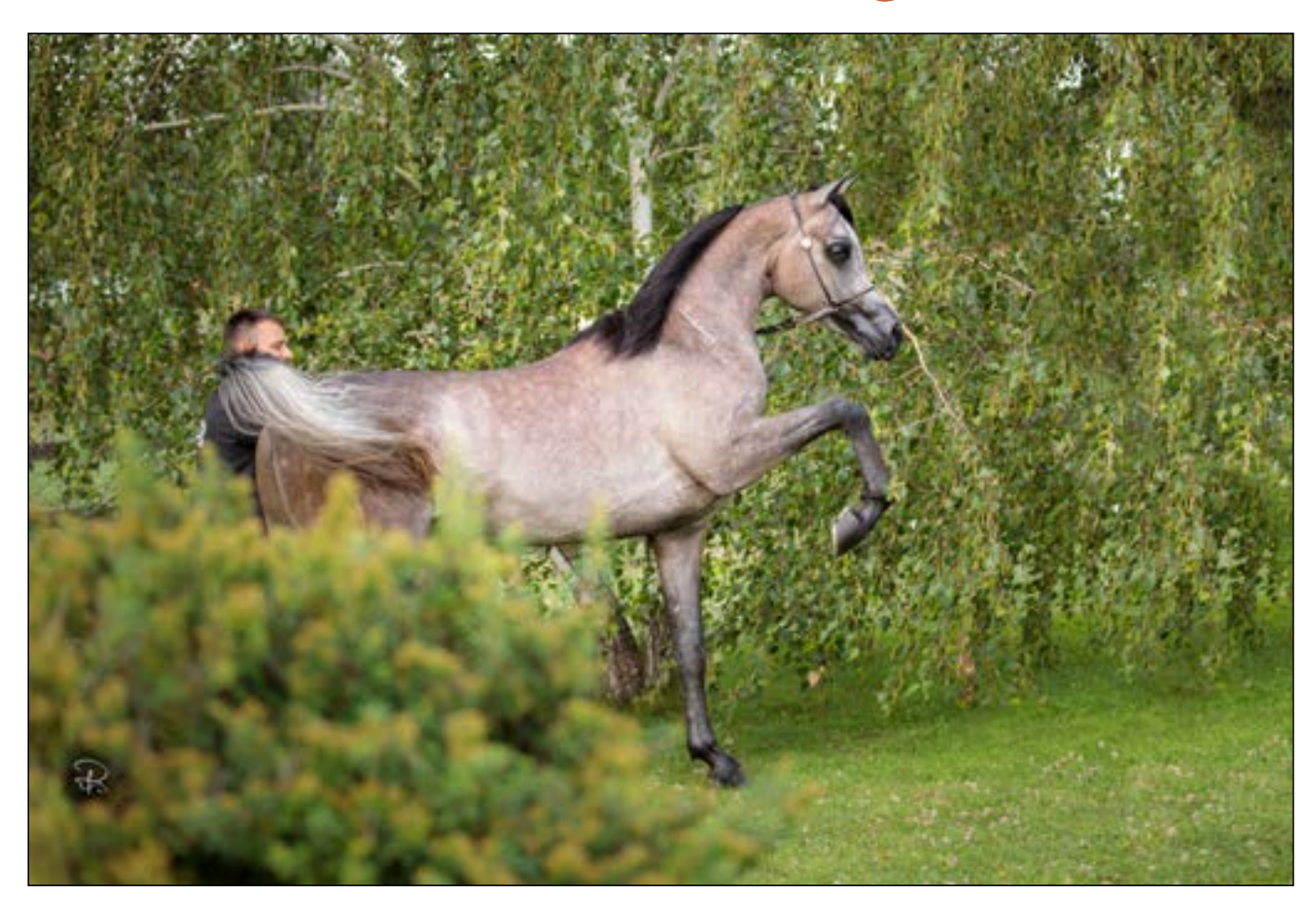
Arshan H (Vesuvius DPA x Magic Soraya) by Ansata Shaamis