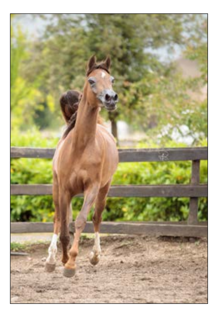
Alayta H (Vesuvius DPA x Anisah Star) by Windsprees Mirage