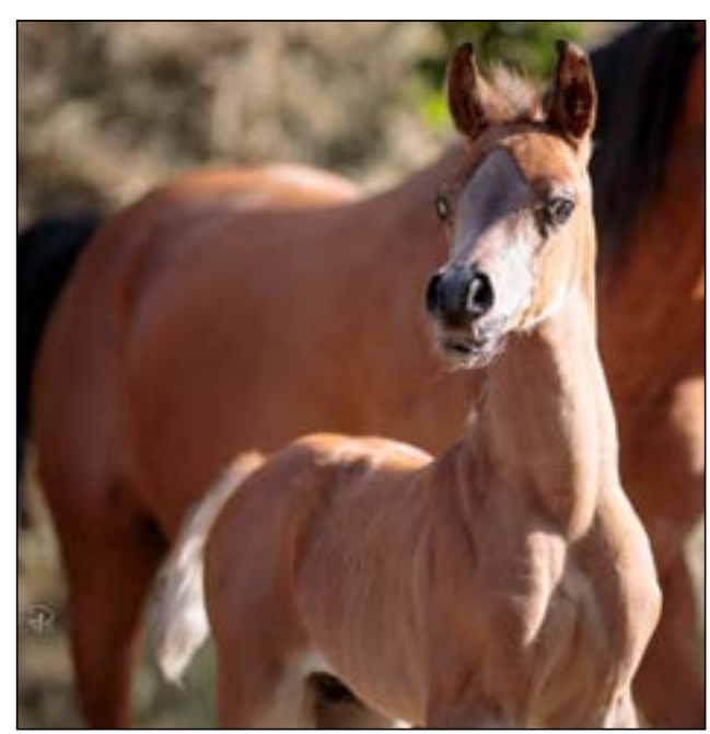
Santiago DCF (Vesuvius DPA x Lady Amneris)